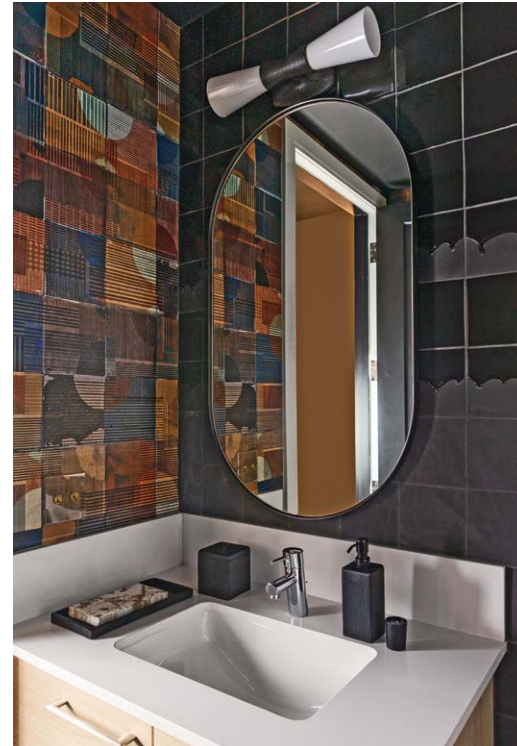
ABOVE: In the powder bath off the den, Gilmore chose wall tile behind the mirror with a design that appears as if paint is dripping down. She paired that with bold wallpaper with a geometric pattern, mimicking the dark colors in the den.