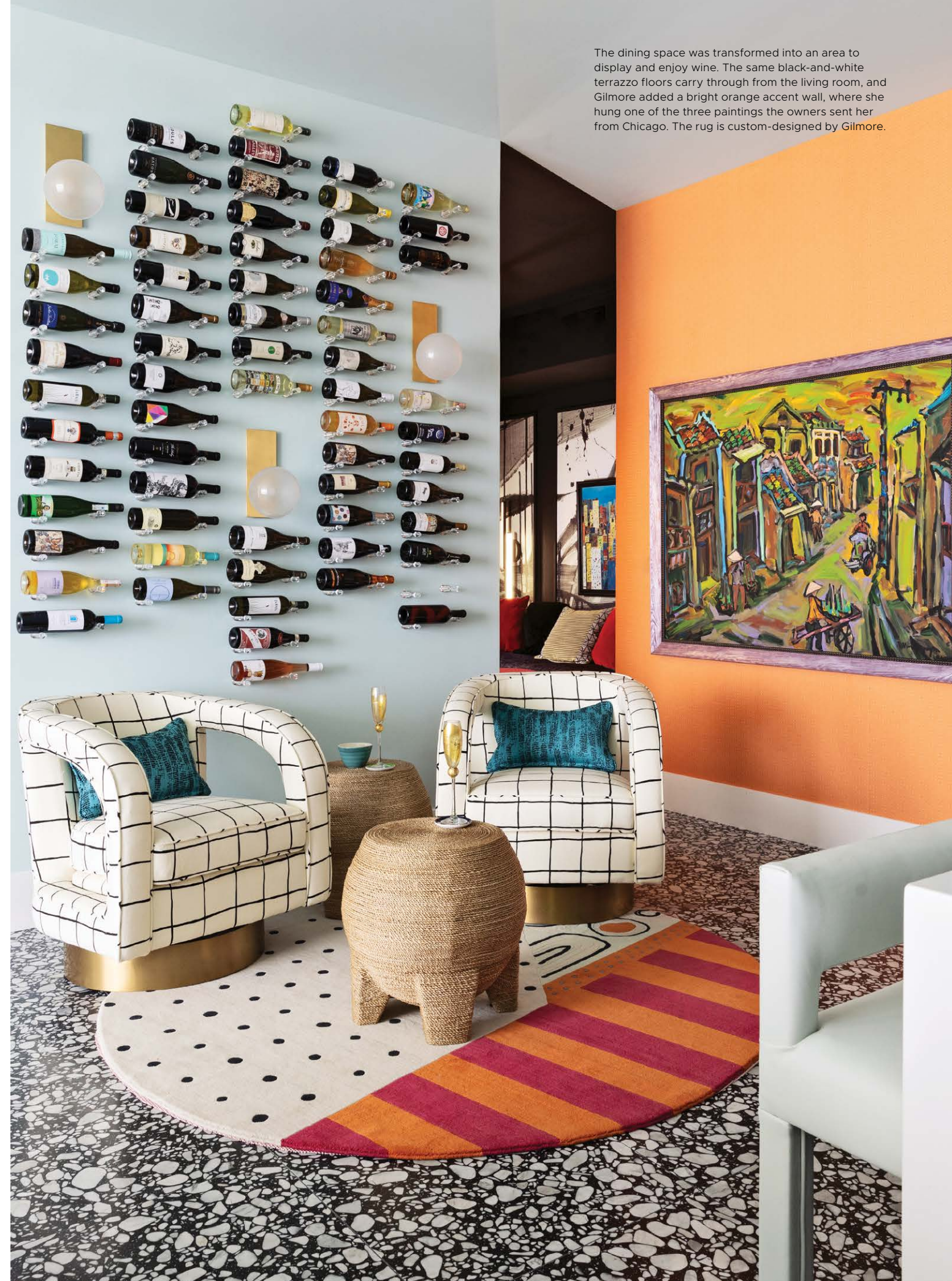
The dining space was transformed into an area to display and enjoy wine. The same black-and-white terrazzo floors carry through from the living room, and Gilmore added a bright orange accent wall, where she hung one of the three paintings the owners sent her from Chicago. The rug is custom-designed by Gilmore.